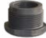
ABOT MANŞON HYDRANT SOCKET