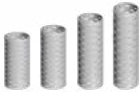
MEÇ İÇ TAKIM MEC CARTRIDGE