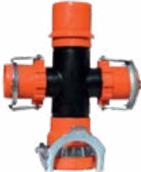
KELEPÇELİ İSTAVROZ CLAMP CROSS