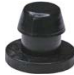
7 MM KÖRTAPA 7 MM ADAPTER