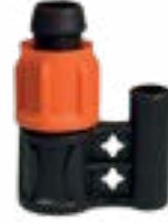
VİDALI MİNİ SPRINK ADAPTÖRÜ MINI SPRINK ROD ADAPTER