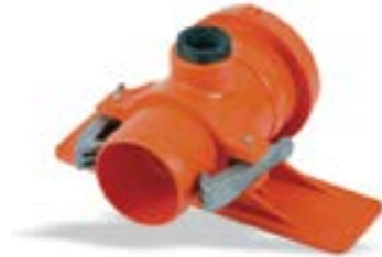
MANDALLI ABOT LATCH HYDRANT