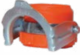
KELEPÇELİ DİŞİ KÖRTAPA FEMALE CLAMP END CAP