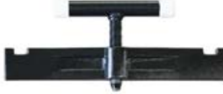
KELEBEK SOMUN TAKIMI BUTTERFLY NUT KIT