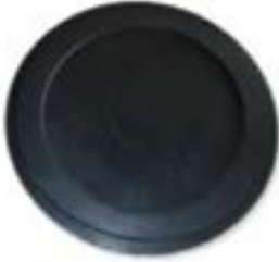
FİLTRE KAPAK CONTASI FILTER CAP GASKET