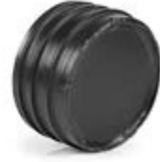
KÖRTAPA END CAP