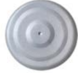
FİLTRE KAPAĞI FILTER CAP