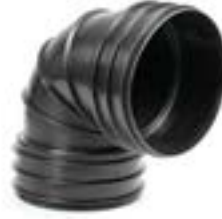
90° DİRSEK 90° ELBOW