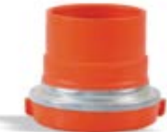
MANDALLI DİŞİ BAŞLIK FEMALE LATCH HEAD