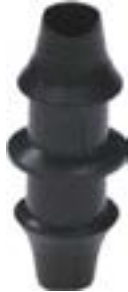
7 MM HORTUM EKİ 7 MM WOLF MOUTH CUFF