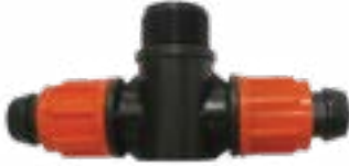
ABOT ÜSTÜ TE CROSS ABOVE TEE