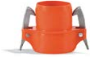
MANDALLI ERKEK KÖRTAPA MALE LATCH END CAP