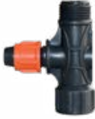
ABOT ÜSTÜ TEK TARAF LI CROSS ABOVE SINGLE OUTPUT