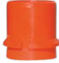
KELEPÇELİ ERKEK BAŞLIK MALE CLAMP HEAD