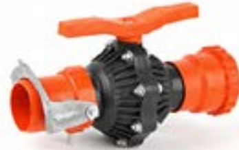
KELEPÇELİ HAT VANASI CLAMP REDUCER