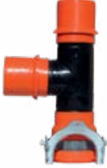
KELEPÇELİ TE CLAMP TEE