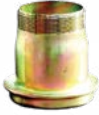
MANDALLI DEMİR DİŞİ LATCH IRON FEMALE MOTOPOMP