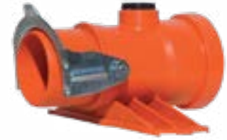
KELEPÇELİ ABOT CLAMP HYDRANT