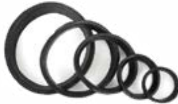
MANDALLI CONTA LATCH GASKED