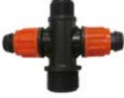
ABOT ÜSTÜ İSTAVROZ ERKEK MALE CROSS ABOVE HYDRANT