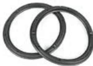
EK PARÇA CONTASI FITTING GASKET