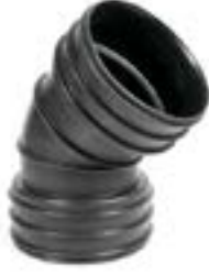
45° DİRSEK 45° ELBOW