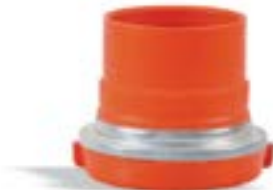
MANDALLI DİŞİ KÖRTAPA FEMALE LATCH END CAP