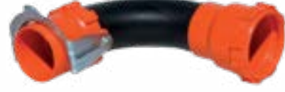
KELEPÇELİ DİRSEK CLAMP ELBOW