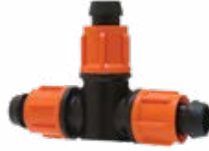
EKLEME TE CONNECTOR TEE