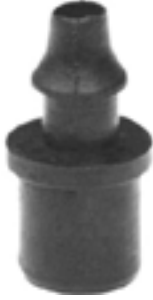
7 MM START ÇIKIŞ 7 MM START EXIT