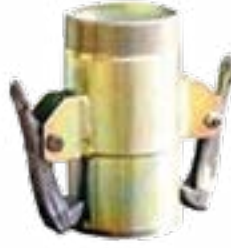
MANDALLI DEMİR ERKEK LATCH IRON MALE MOTOPOMP