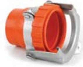
KELEPÇELİ DİŞİ BAŞLIK FEMALE CLAMP HEAD