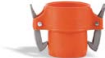
MANDALLI ERKEK BAŞLIK MALE LATCH HEAD